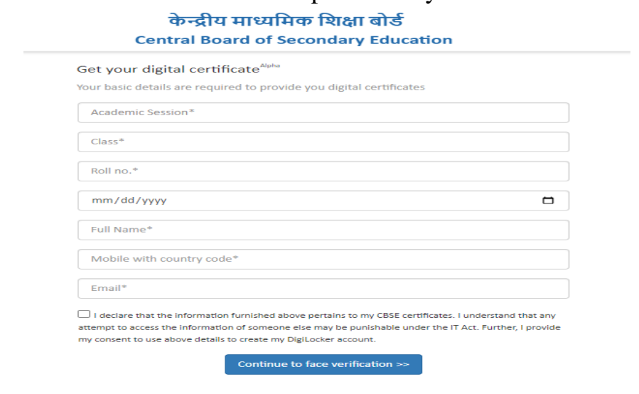
Option 3: Students can access the mark sheet and certificate by creating a ticket on <a href="https://support.digitallocker.gov.in/">https://support.digitallocker.gov.in/</a> with the category "CBSE International Student 2023".

It will match the student's photograph with the image available on the mark sheet. If the description and the image match then the mark sheet will be sent to the email address provided by the student