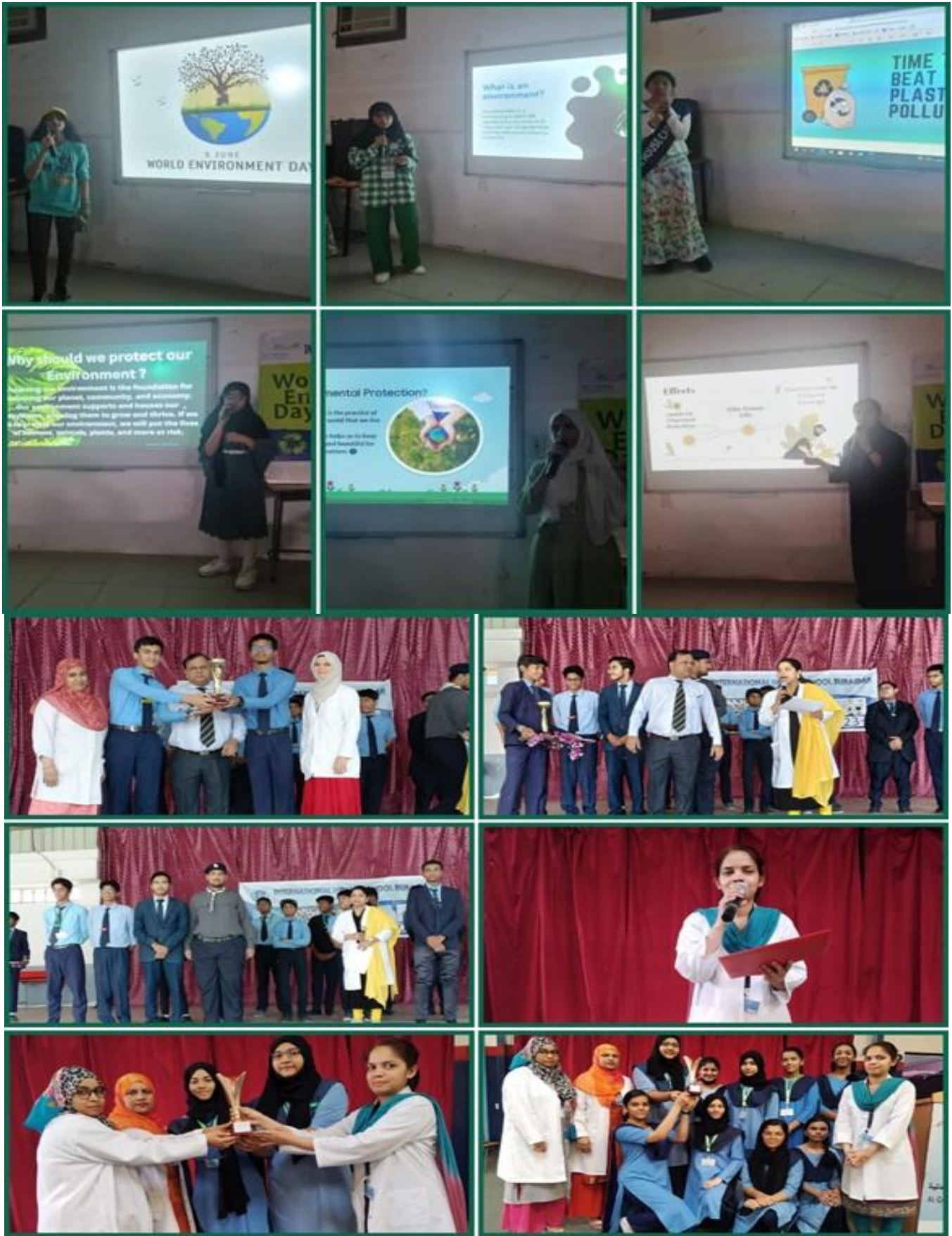
Winners of the Power point presentation: Boys Section => First Position – Yellow House Girls Section => First Position – Green House