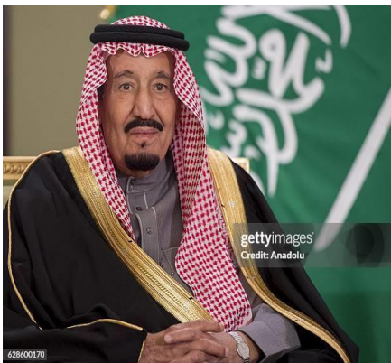
King Salman Bin Abdulaziz Al Saud